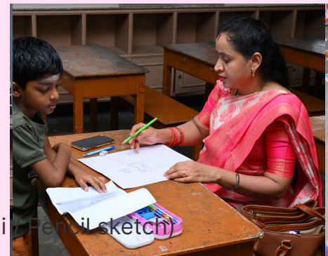
Competitive events (Cooking without fire / Rangoli / Pencil sketch)

The celebration served as a meaningful platform to recognise the achievements of women and to promote equality, confidence, and leadership among them. SBIOA (CC) reaffirmed its commitment to continue supporting initiatives that promote the welfare, empowerment and recognition of women members.